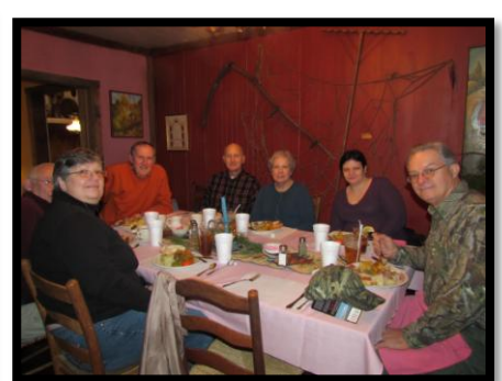
A Swiss Lunch (Al)

Upshur County Photos Needed: Create Buckhannon is planning on publishing a 2014 Collection Calendar of Upshur County. They have invited our camera club to submit photos of Upshur County for inclusion in their calendar. Their goal is to have the calendar available for sale in September. Entries should be sent to Melodie Stemple – 99 Edmiston Way Suite 102 or email to info@upshurda.com . Submit your photos, either digitally or hard copy by July 15. Be sure to provide your contact information and where you took the photo. Let's help Create Buckhannon in this neat effort to showcase Upshur County and raise funds for their important work.