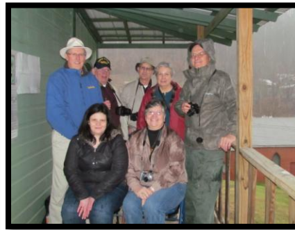
Out of the Rain (Al)