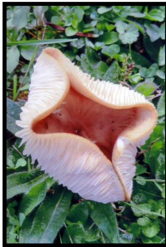
Folded Mushroom Alice Neitzert